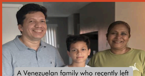
A Venezuelan family who recently left the NYC shelter system and relocated.